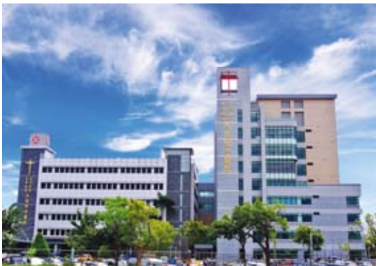
18 馬偕醫院臺東分院新大樓。 New building of McKay Hospital, Taitung Branch