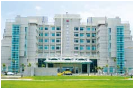
12 三總澎湖分院醫療大樓。 The medical building of Tri-Service General Hospital's Penghu Branch

年提供兩院醫療營運維持所需費用，以維持穩定的醫療作業水準。 此外，衛生福利部澎湖醫院與澎湖各離島衛生所合作遠距醫療視訊會診，並且與高雄榮總及高雄長庚醫院合作遠距視訊，以即時獲得大型醫學中心支援。