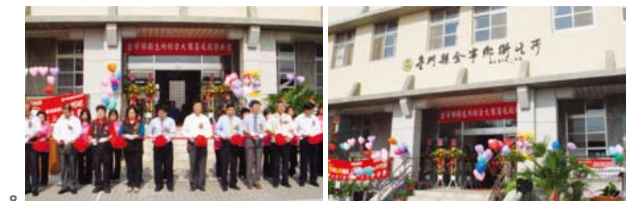
9 10 金門縣金寧鄉衛生所。（2009年十月二十八日啟用）

此外，為提供金寧鄉鄉親更優質的醫療服務空間，金寧鄉衛生所辦公廳舍新建工程，於2009年完工，並於同年十月二十八日正式啟用，提供醫療服務（圖9、10）。