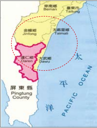
17 臺東南迴線四鄉位置圖。 Position of four Townships in the Taitung southern link

臺東縣全縣有十六個鄉鎮，均為原住民族地區或離島鄉，其中，南迴線經過達仁鄉、大武鄉、金峰鄉及太麻里等四鄉（圖17）。為了強化臺東蘭嶼、綠島醫療在地化，採行的措施包括：由健保IDS提供專科醫療、協助衛生所重擴建、完成醫療資訊化及醫療影像傳輸系統、建置衛生所醫療電子病歷、培育養成公費生等。